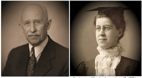
Orville Wright, born Aug. 19, 1871