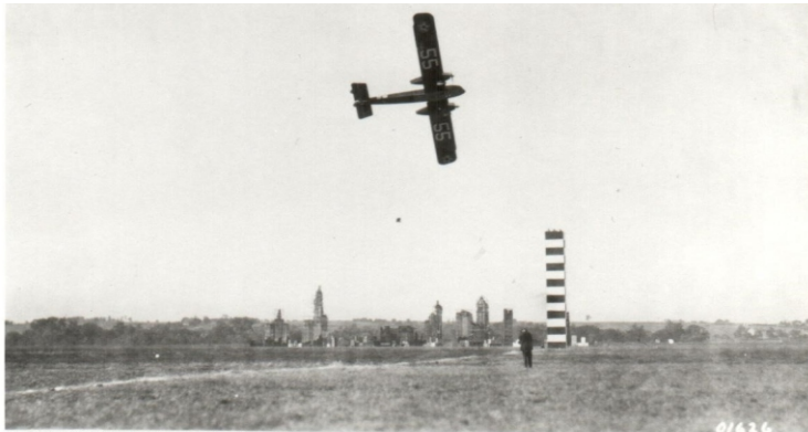
Aeromarine NBS-1 in flight during the 1924 Air Races

DAYTON, Ohio — Dayton Aviation Heritage National Historical Park will host an event at the Huffman Prairie to commemorate the International Air Races and aviation history in Dayton.