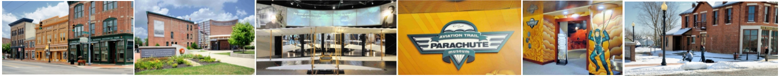
Aviation Trail Visitor Center • Wright-Dunbar Interpretive Center • Dayton Aviation Heritage National Historical Park Corner of W. Third & S. Williams Sts., • 16 S. Williams St., Dayton, OH 45402 • (937) 225-7705

PRINT VERSION: this file is a print version of the e-mail newsletter that is sent out on a free subscription basis. To get on the e-mail subscription list go to the Aviation Trail website at www.aviationtrailinc.org and subscribe by using the "Subscribe Now" button on the footer of each page. This version is more suited for printing hard copies than the e-mail version and is available on the Aviation Trail website "Newsletters and Brochures" page: http://www.aviationtrailinc.org/newsletters .