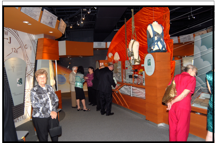
Guests at the Parachute Museum re-opening look at exhibits.

Video productions for the exhibits were the responsibility of Main-sail Production Services, Dayton, Ohio, through Exhibit Concepts.